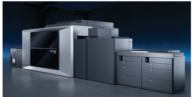
The unveiling of the Jetfire 50 at drupa marked a significant milestone for HEIDELBERG.