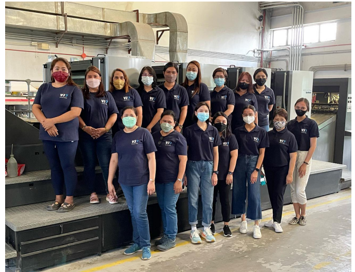
The VJ7 Team

VJ7 has grown and it has set its sight on becoming a one-stop shop for a diverse range of printed products.