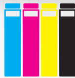
CMYK plus 5th Color