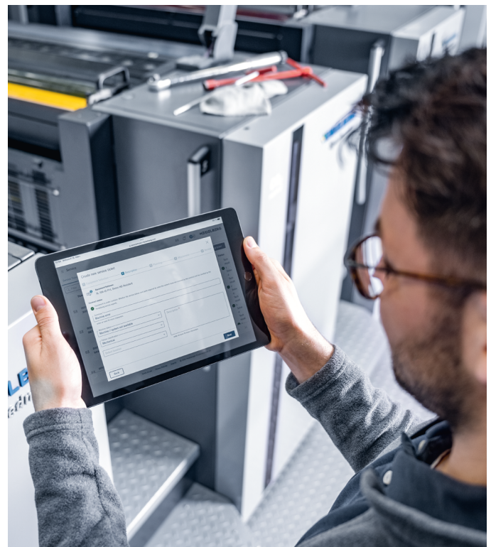
Regular maintenance by our Service engineers: Ensuring Peak Performance of your machine.

The Maintenance Manager is a fully digitalized, cloud-based solution that makes customer maintenance intervals for your machine simple and convenient. It provides uncomplicated support by ensuring transparent maintenance processes, avoiding incorrect maintenance measures, and minimizing machine downtime. The Maintenance Manager also allows you to view the maintenance status and progress at any time and from anywhere.