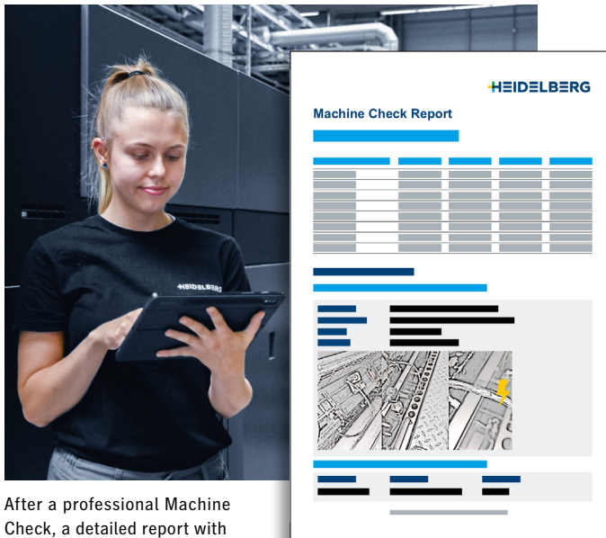
After a professional Machine Check, a detailed report with recommended actions is provided.