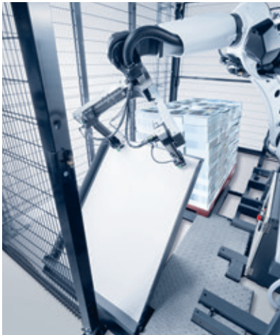
Absolute freedom for the operator: Automated insertion of intermediate layers by the StackStar P.