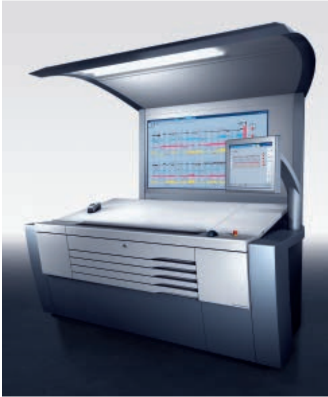
Operation of Prinect Inpress Control 2 is integrated in Prinect Press Center. Color and register are automatically measured and controlled on the fly.