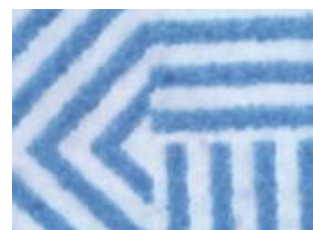
Fine detail reproduction